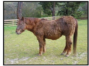
Severe hypertrichosis and muscle loss with PPID