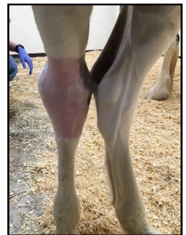
Swollen right hock in septic foal